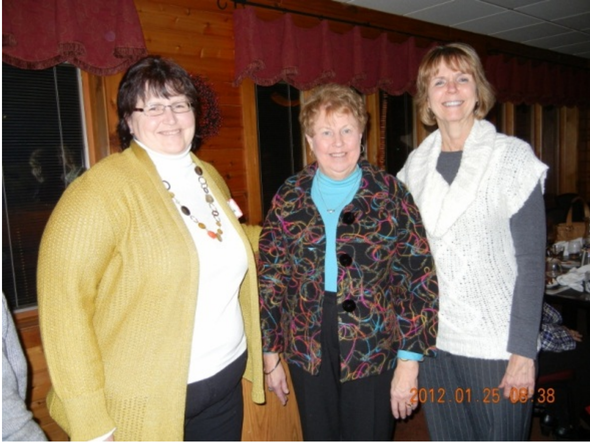
Photo of the recipients of the awards given out at the January quarterly meeting.